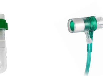
Boussignac CPAP: 5570.13